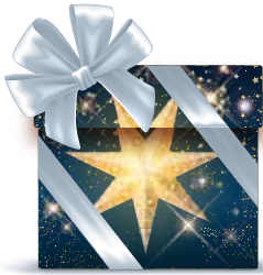
STARRY & BRIGHT